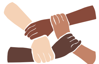
Diversity, Equity and Inclusion