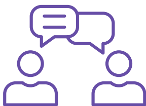
Communication & Collaboration