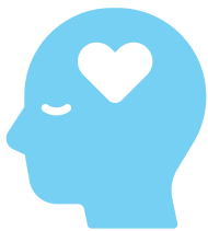
Mental Health & Wellbeing

At CSLC 2024, youth will engage in workshops in the following areas of interest: